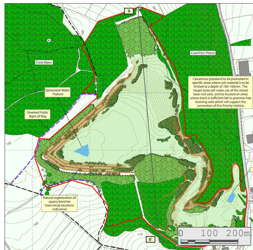
SECTION B - B' ON CONCEPT RESTORATION (M18.155.D.007)