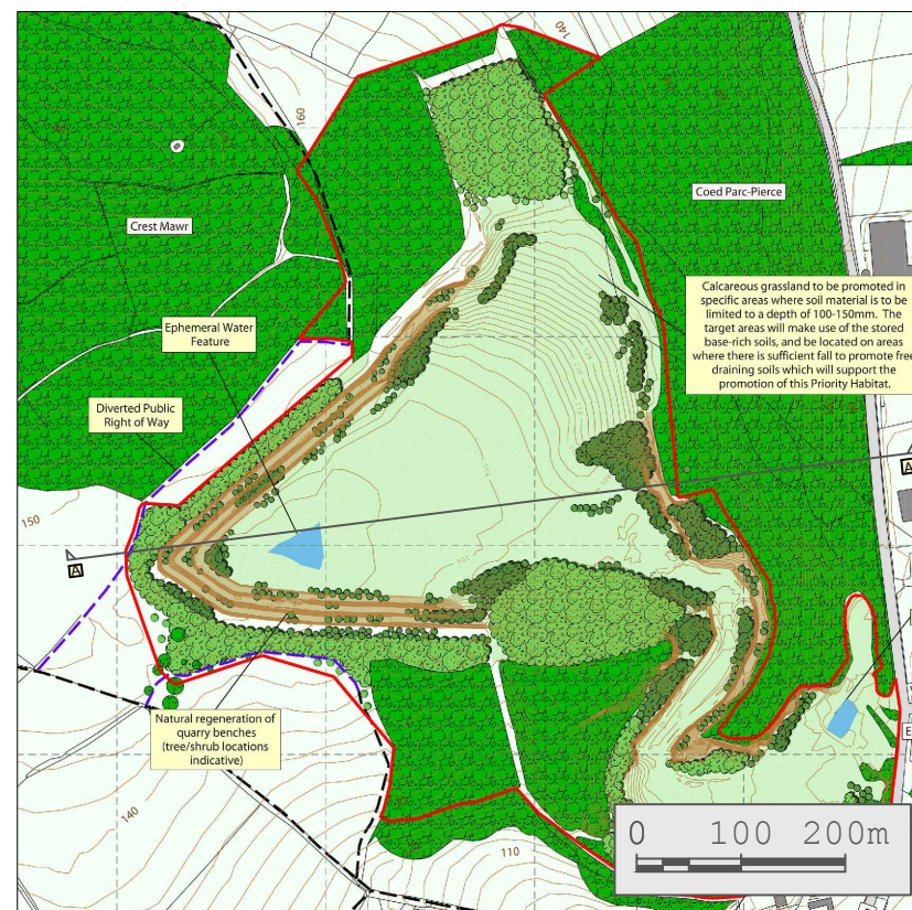
SECTION A - A' ON CONCEPT RESTORATION (M18.155.D.007)